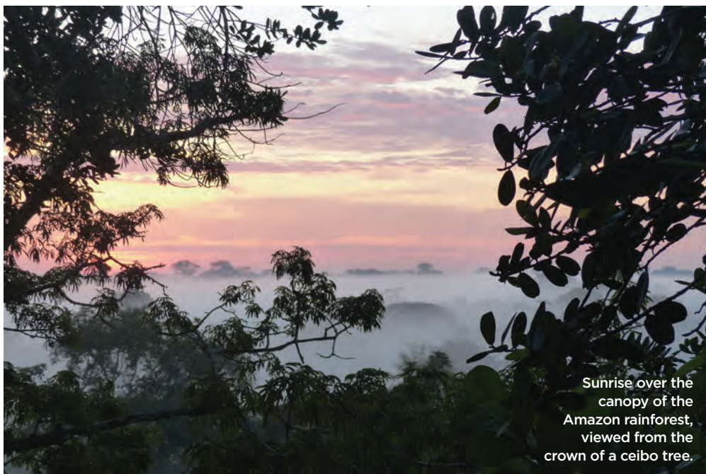
Sunrise over the canopy of the Amazon rainforest, viewed from the crown of a ceibo tree.

A UTHOR DAVID George Haskell has won acclaim for eloquent writing and deep engagement with the natural world. In his talk this fall, he will describe how he has