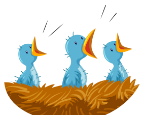
A Place to Raise Babies